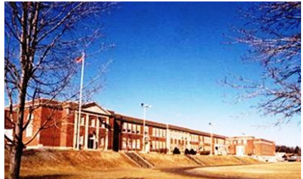
Arlington Middle School Poughkeepsie 601 Dutchess Turnpike Poughkeepsie, New York 12603

For those of you living in or near the Hudson Valley there is a wonderful opportunity to observe and enjoy the traditions of sangerfest in the first night celebrations. On Friday 8 June, the 36 th Sangerfest starts with a Beef Burgundy Dinner 4:00 to 5:30 pm at the Poughkeepsie Germania Clubhaus ($ 15.00)