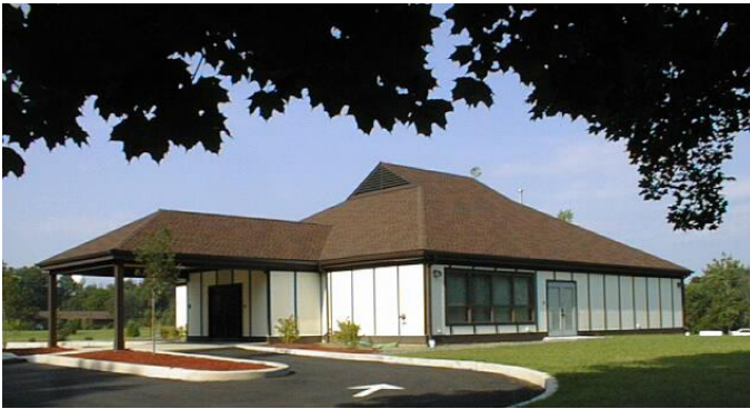
Germania of Poughkeepsie Clubhaus 37 Old Degarmo Road. Poughkeepsie New York 12603 (845) 471-0609

On the weekend of 8, 9, 10 June 2012, the Germania Singers of Poughkeepsie, New York will host our 36 th Sangerfest. The First Night Kick-Off Celebrations are open to the public and will be held at two nearby locations.